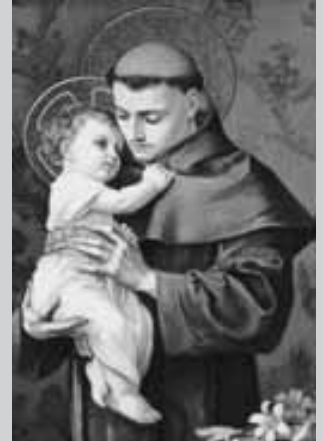
St. Anthony of Padua

Masses: Saturday 5:00 p.m. Sunday 8:30 a.m.